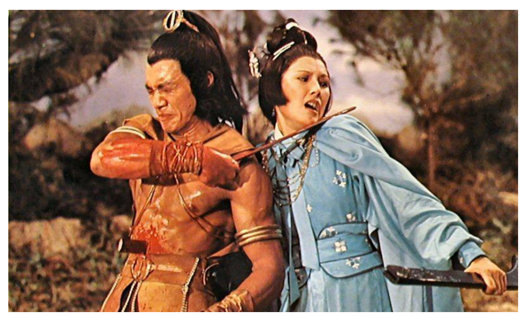
Figure 4. Leng Feng defeating Golden Arm.

Stills from Kid with the Golden Arm , 1979