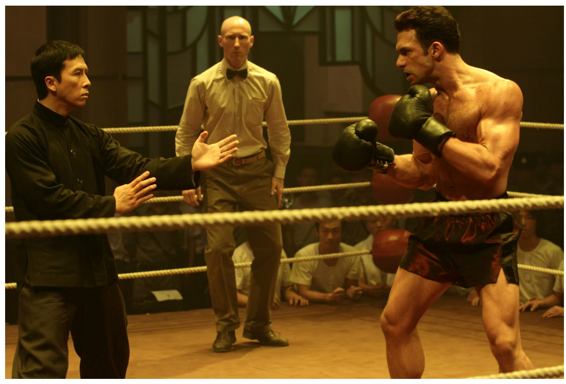
Figure 1. Ip Man vs. Twister.